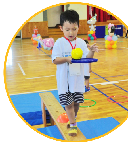
Balance helps children climb stairs and walk on uneven surfaces, like grass or sand.